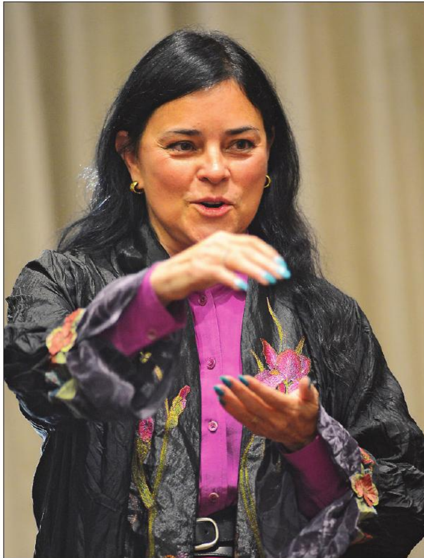
Diana Gabaldon speaks at last year's Surrey International Writers Conference at the Sheraton Vancouver, Guildford. This year's conference will be held Oct. 24-26 at the Sheraton Vancouver Guildford.